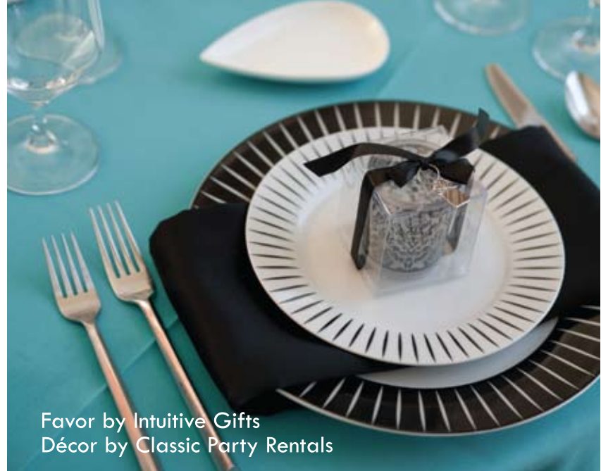
Favor by Intuitive Gifts Décor by Classic Party Rentals