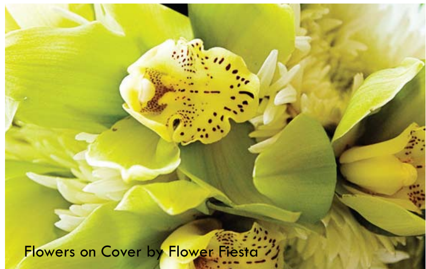
Flowers on Cover by Flower Fiesta