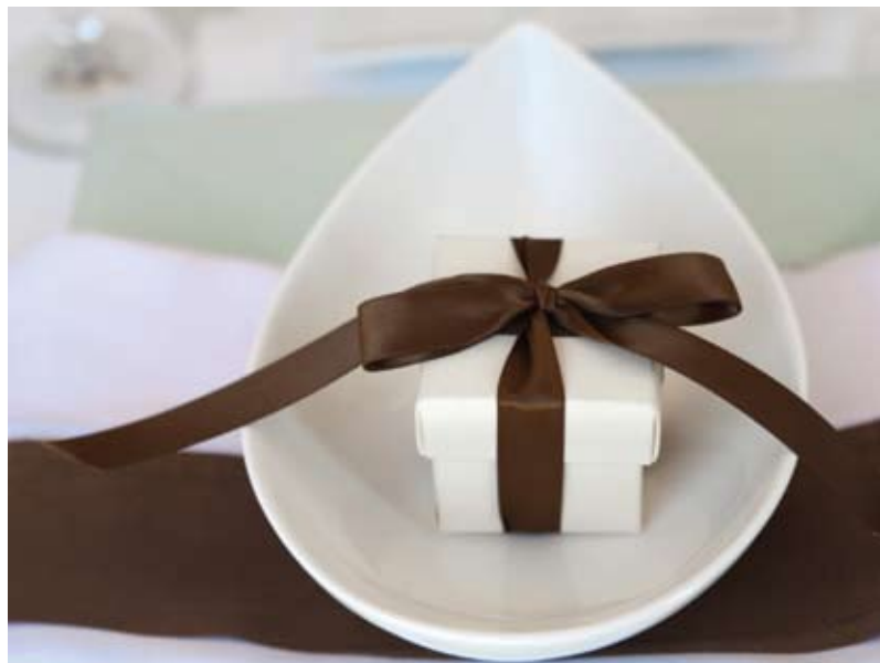
Décor by Classic Party Rentals Accessories by Basket Works & Beyond