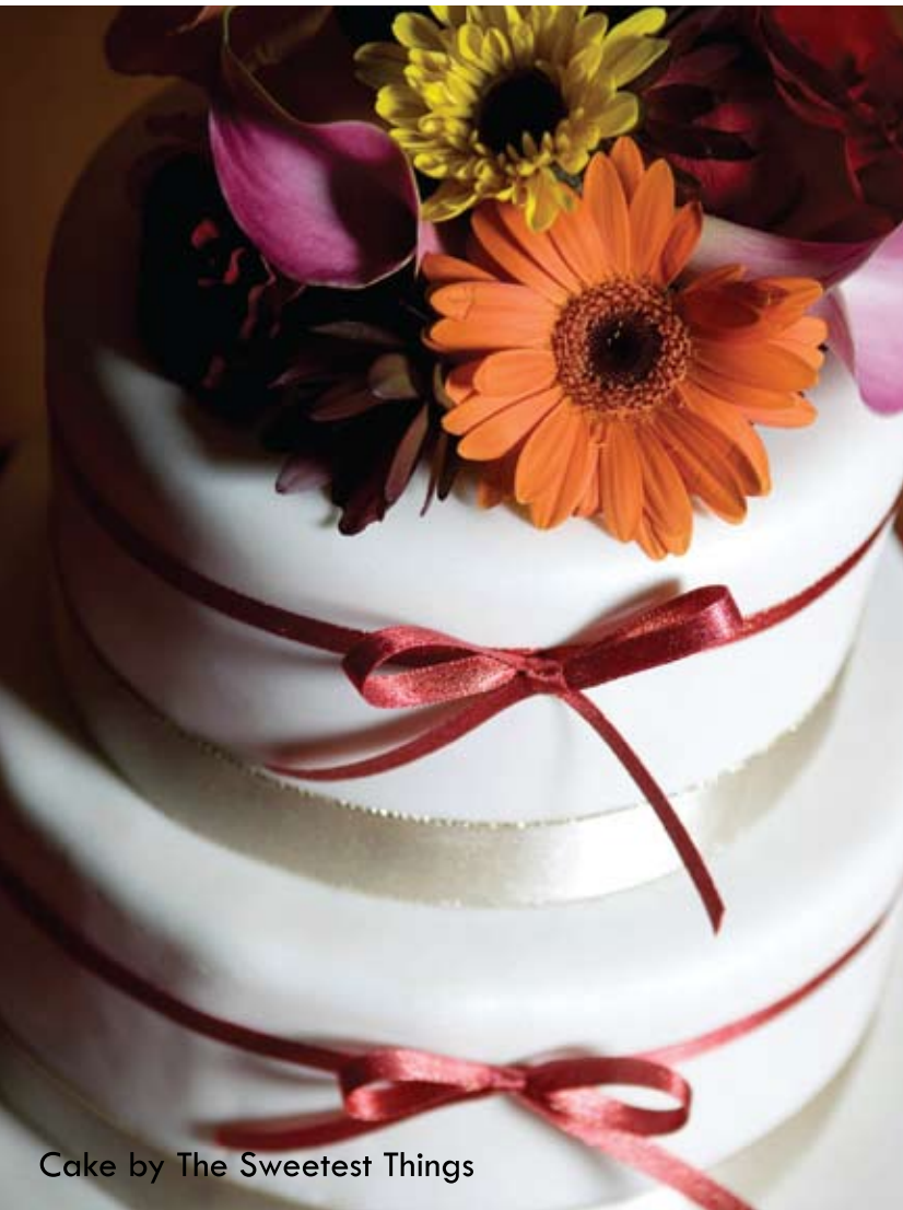
Cake by The Sweetest Things