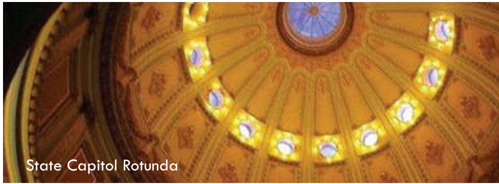
State Capitol Rotunda