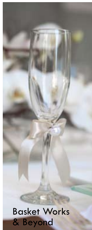
Basket Works & Beyond