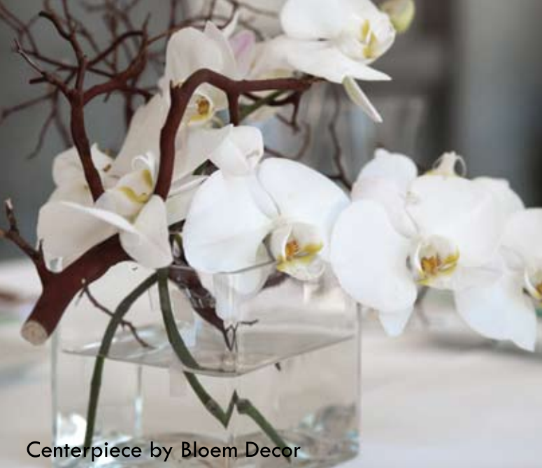
Centerpiece by Bloem Decor