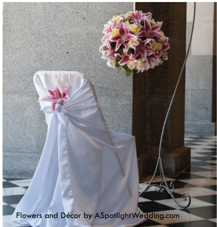
Flowers and Décor by ASpotlightWedding.com