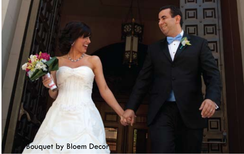
Bouquet by Bloem Decor