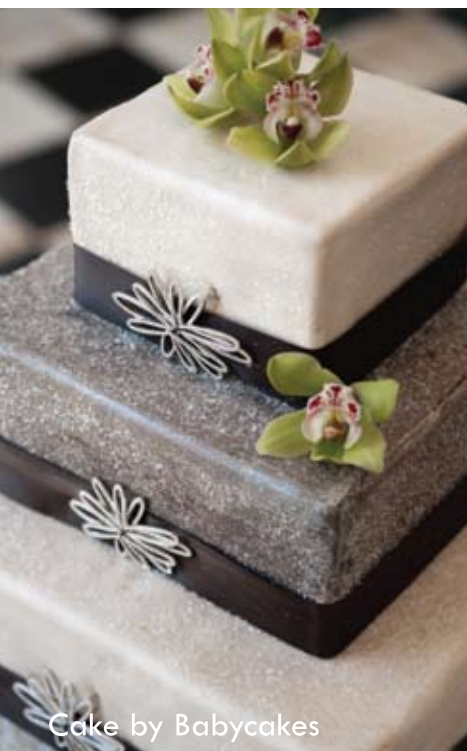
Cake by Babycakes